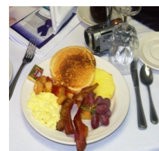
Portions of the magnificent breakfast served during the silent auction