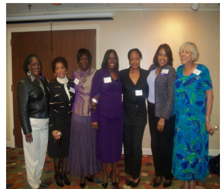
HM2 Members and Volunteers