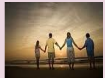
Restoring Broken Families

Mission: To provide outreach, advocacy, resources, life skill services, education, research and related activities to underserved populations of abuse women, children and families.